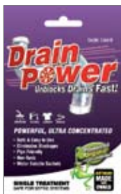
New hang sell twin dose

Drain Power™ Clears blocked drains quickly and naturally