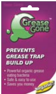
Hang sell twin pack

Grease Gone™ Grease trap treatment and maintenance for use in all systems.