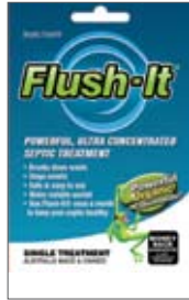
Impulse buy pack

Flush-It® For the treatment and maintenance of Septic Systems