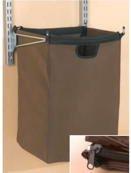
1604 – Zip & Carry Bag With Hang Bracket (For Use with Vertical Hang Rails)