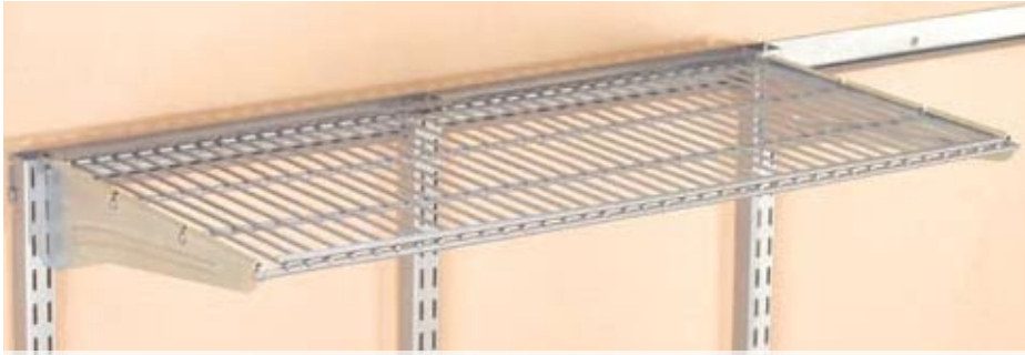
1620 – 31" Wire Shelf With Lock-On Brackets (For Use with Vertical Hang Rails)