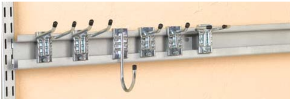
1610 – 31" Combination Rail Kit with 6 Assorted Hooks (For Use with Vertical Hang Rails)