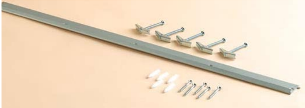
1600 – Top Track With All Mounting Hardware (for mounting to hollow, concrete or studded walls)