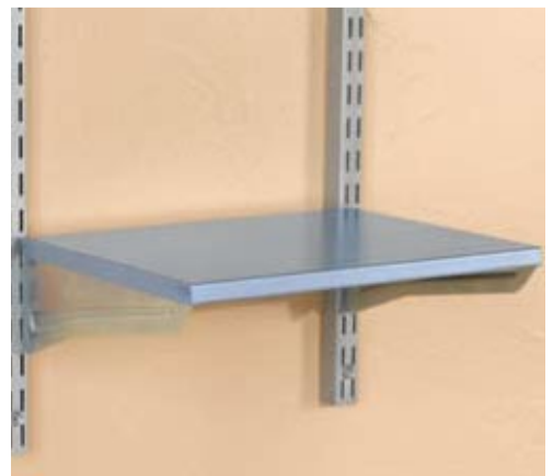
1680 – 15" Deep Shelf With Lock-On Brackets (For Use with Vertical Hang Rails)