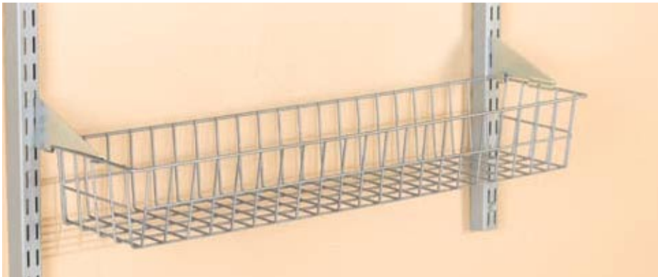
1615 – 31" Basket With Lock-On Brackets (For Use with Vertical Hang Rails) 1675 – 15" Basket With Lock-On Brackets (For Use with Vertical Hang Rails)