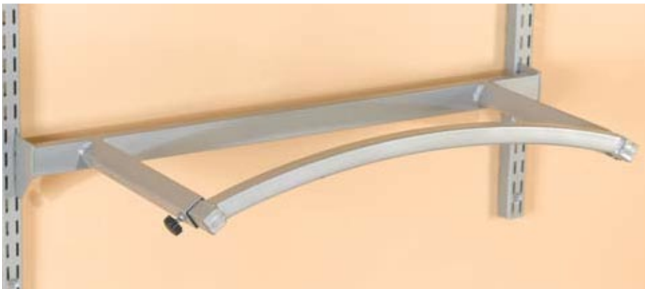
1625 – 31" Wide Adjustable Universal Storage Rack/Tire Holder Adjustable depth 13.75" to 23.5" (For Use with Vertical Hang Rails)