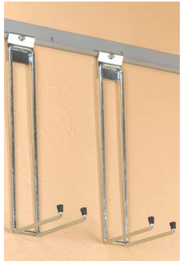
1638 – 2 Pack Large Tool Keepers (For Use with Top Track)

Storability Wall Storage Centers are built on 14 gauge, epoxy powder coated steel frames featuring remarkable holding strength and providing years of heavy-duty use.