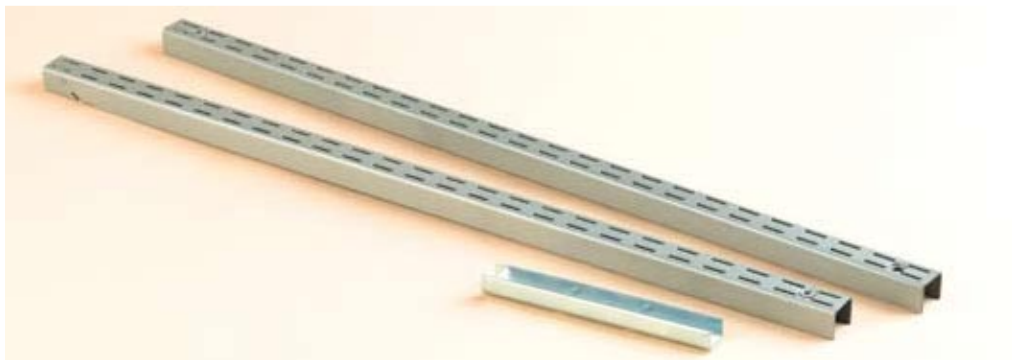
1601 – 3 Part Vertical Hang Rail With All Mounting Hardware