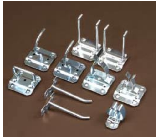
1635 – 10 Piece LocHook™ Assortment for Steel LocBoards™