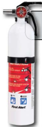
FE10GO Garage Fire Extinguisher

Also available in Marine White color: FE5GO-MN