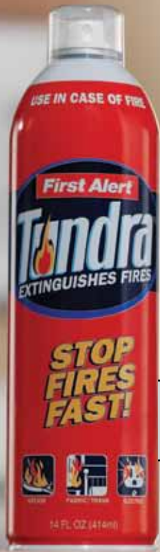
AF400 Tundra Fire Extinguisher Spray