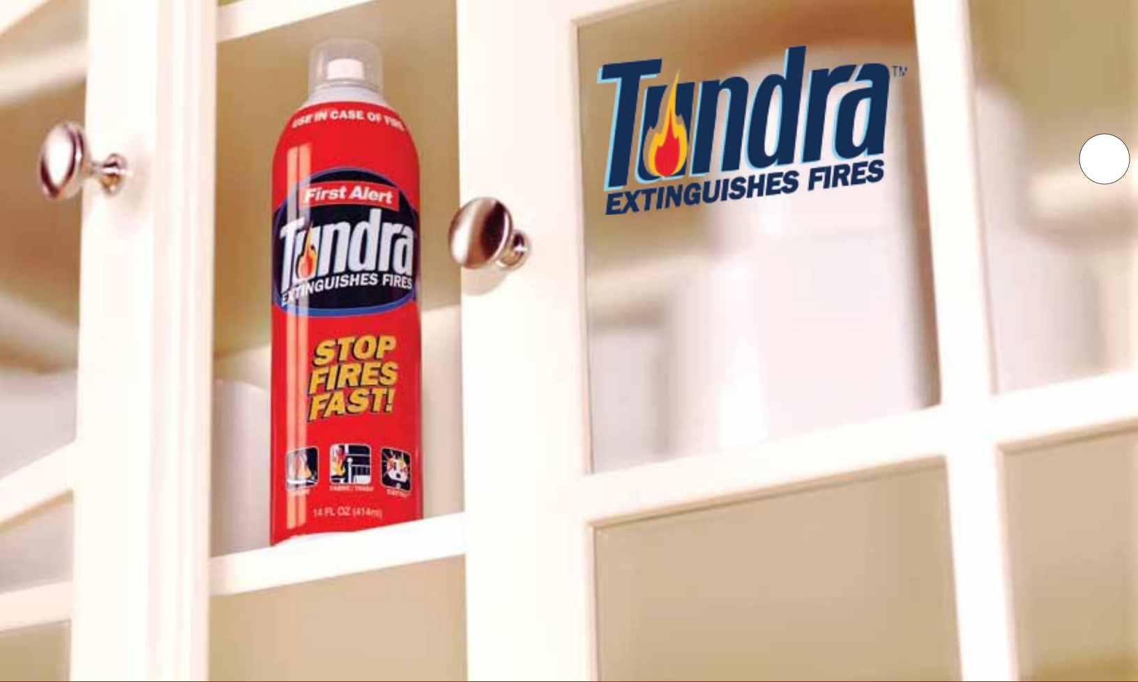
Standard 4 Pack Tray Part #: AF400