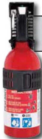
FESA5 Auto Fire Extinguisher

Also available in Pewter color: KFE2S5PW