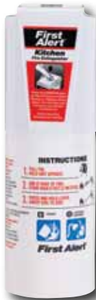
KFE2S5 Kitchen Fire Extinguisher