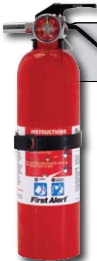
FE5GO Recreation Fire Extinguisher